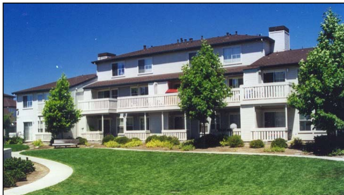
Corona Ranch Lower-Income Family Units

In the past, the Low-Income Housing Tax Credit Program encouraged the production of affordable housing with a relatively higher proportion of four-bedroom units. As indicated above, the City also promotes the inclusion of larger units. Examples include the 74-unit Corona Ranch project, which has 32 three-bedroom and 10 four-bedroom units and Round Walk Village, which has 47 three-bedroom and 6 four-bedroom units. Logan Place, a proposed 66-unit family rental will include units for large families.