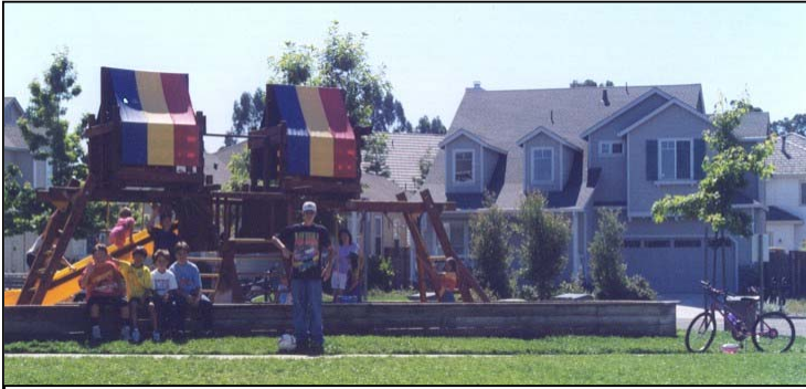
Hillview Oaks Townhomes - Affordable Multi-Family Residential

Low- and moderate-income households often need assistance to purchase their first home. The City of Petaluma has participated in the federal Mortgage Credit Certificate Program since 1993, during which time more than 90 first-time low- and moderate-income homebuyers have been able to purchase a home in Petaluma. Under this program the IRS allows eligible homebuyers with a MCC to take 20 percent of their annual mortgage interest as a dollar-for-dollar tax credit against their federal personal income tax. This enables first-time buyers to qualify for a larger mortgage than otherwise possible, and can thus bring homeownership within their reach. The MCC program is administered locally by the Community Development Commission of Sonoma County;