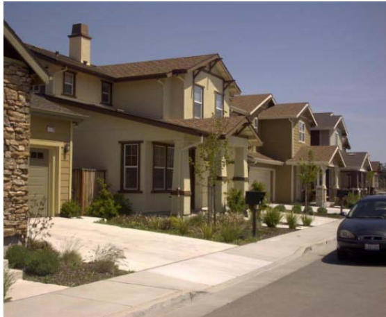
FRATES SQUARE, SOUTHGATE SUBDIVISION

A modification to the current Element's goals has been in the City's first-time homebuyer program. Due to the volatile housing market, the program will now be operated using the Land Trust Model. Petaluma is one of the first cities to incorporate the land trust model into our first-time homebuyer program. In 2008, 26 homes were built by Delco Builders in partnership with the City and the nonprofit Housing Land Trust of Sonoma County. Homes were sold to families with incomes ranging from 80-120% of AMI. Affordability of the home is preserved for future owners through the implementation of a 99-year ground lease. The homeowner owns the house and leases the land beneath it for $55/month retaining exclusive rights to the land.