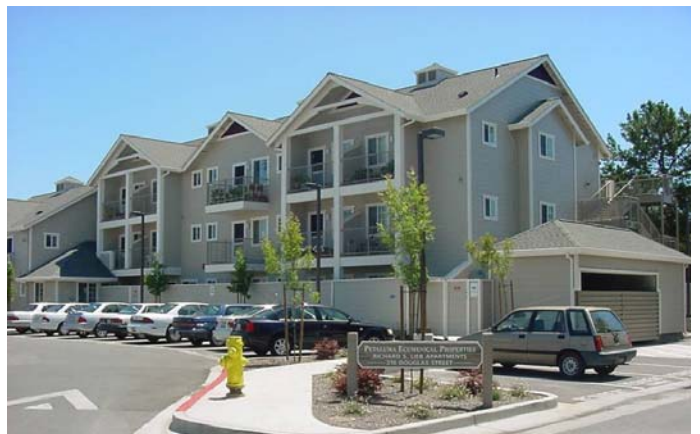
Lieb Senior Apartments – 22 units

The preeminent fact about the elderly population is its size and comparative rapid growth. Slightly more than 16 percent of Petaluma's citizens are over 60 years of age; the fastest growing age group is 85 and over. One in eight Americans is a senior citizen today, compared to 1 in 25 at the dawn of the 20th Century and it is anticipated that during the life of this Housing Element, nearly one in five residents will be seniors. Extending out to 2020, the number of residents 60+ will increase by 34%.