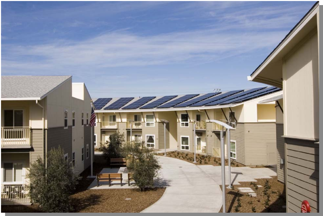
Casa Grande Senior Apartments - Opened January, 2009

(Chapter 11 of Petaluma's General Plan 2025)