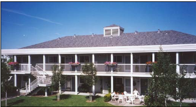
Vallejo Street Senior Apartments

The majority of the elderly are on fixed incomes such as pensions, social security, and personal savings. Many elderly households pay an excessive proportion of their income for housing because their incomes are low. The American Community Survey 2005-2007 identified 347 residents over the age of 65 living in poverty, which is approximately 5.6%.