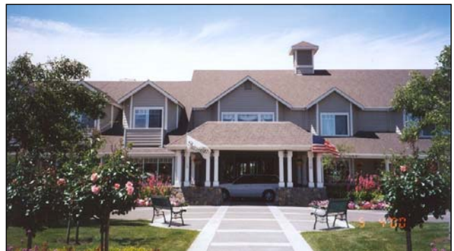
Sunrise of Petaluma Senior Apartments

These programs are projected to assist approximately 200 Petaluma households (450 residents) in FY 2008 and were supported with $141,800 of city housing funds in FY 2008.