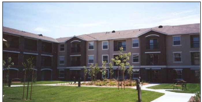
Vintage Chateau Senior Apartments

There are 14 residential care for the elderly facilities licensed in the City, ranging from small residential care homes that can accommodate three to six elderly individuals, to larger facilities such as Adobe House (capacity of 80) and Sunrise of Petaluma (capacity of 89).