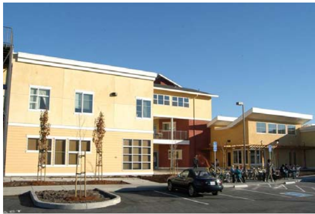
Mary Isaak Center, Opened in November 2004

COTS has been recognized with the Van Loben Sels Foundation Model Practices Award to fund the creation of a manual for other homeless services organizations, and has received numerous United Way Community Impact Awards. Staff from regional shelter programs and programs in Sacramento, Boise, Cleveland and Albany have traveled to COTS to learn more about COTS' uniquely effective integral trauma-informed approach. MIC is supported with $462,000 in funding from the City annually.