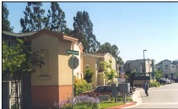
Round Walk Village Affordable Apartments

All of the city's affordable units help to address the housing needs of farmworker households, especially larger rental units. Approximately 15 farmworker households live in two recent affordable projects, Old Elm Village and Round Walk Village Apartments.