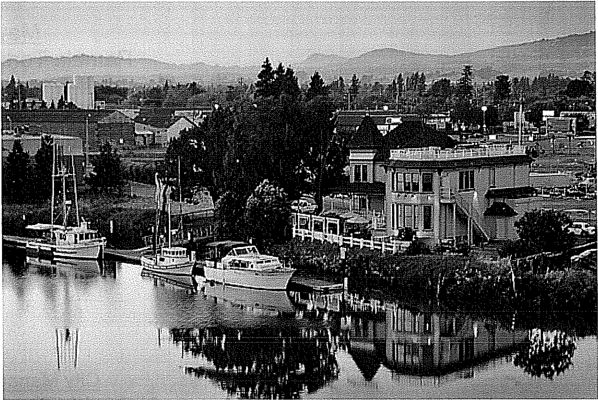
This Victorian style building houses one of many restaurants that surround the Petaluma Turning Basin.