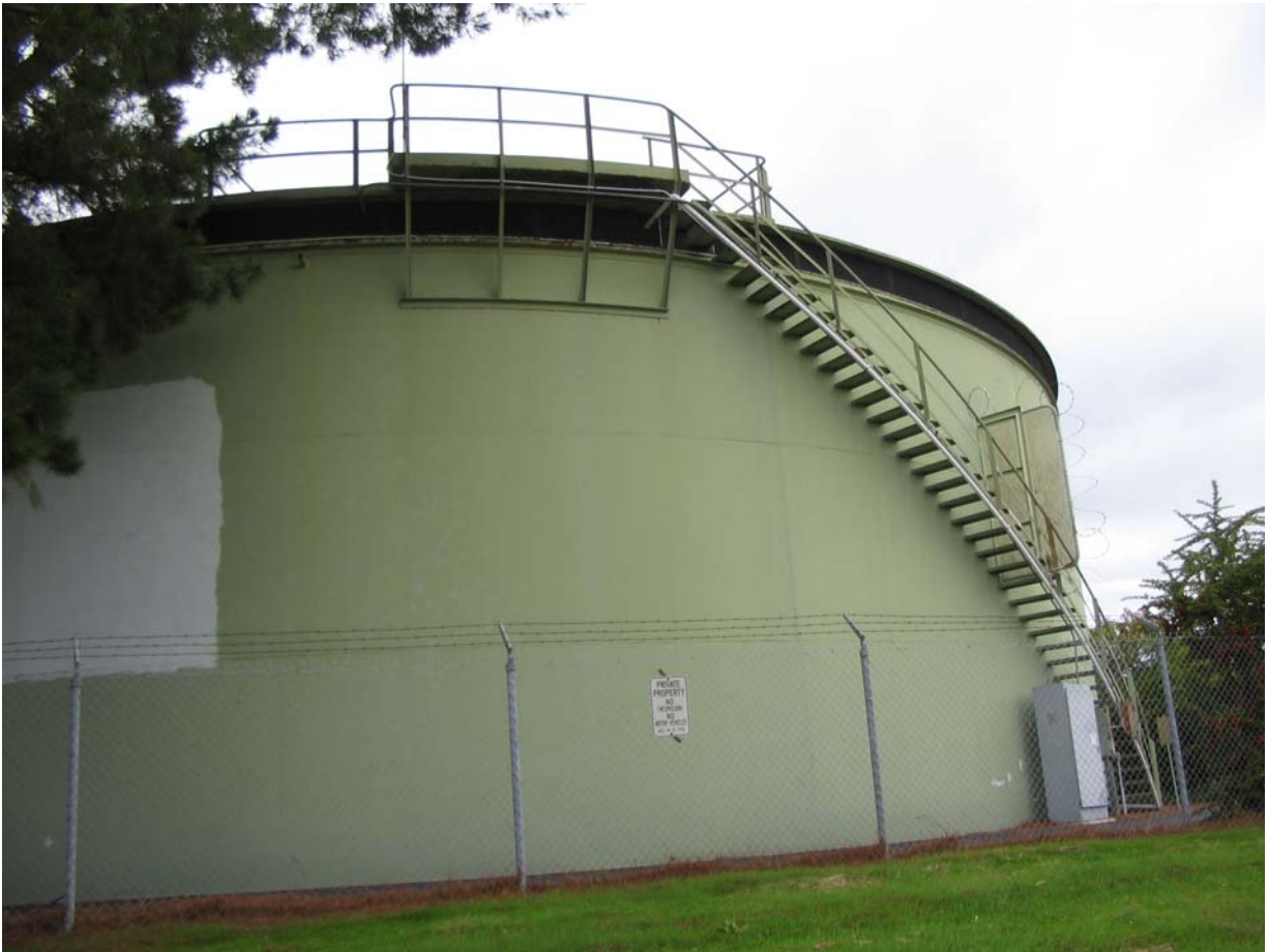
A two million gallon water tank utilized to store emergency water supply.